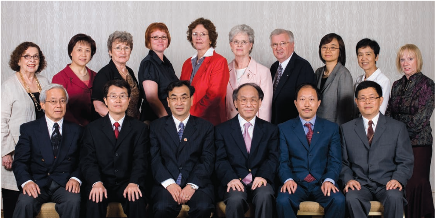
Back row from left to right: